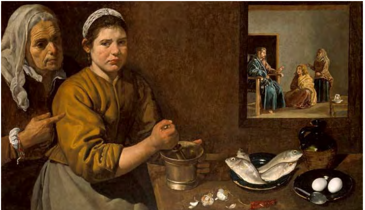
Image: 'The House of Martha and Mary' by Diego Velazquez (1599-1660)