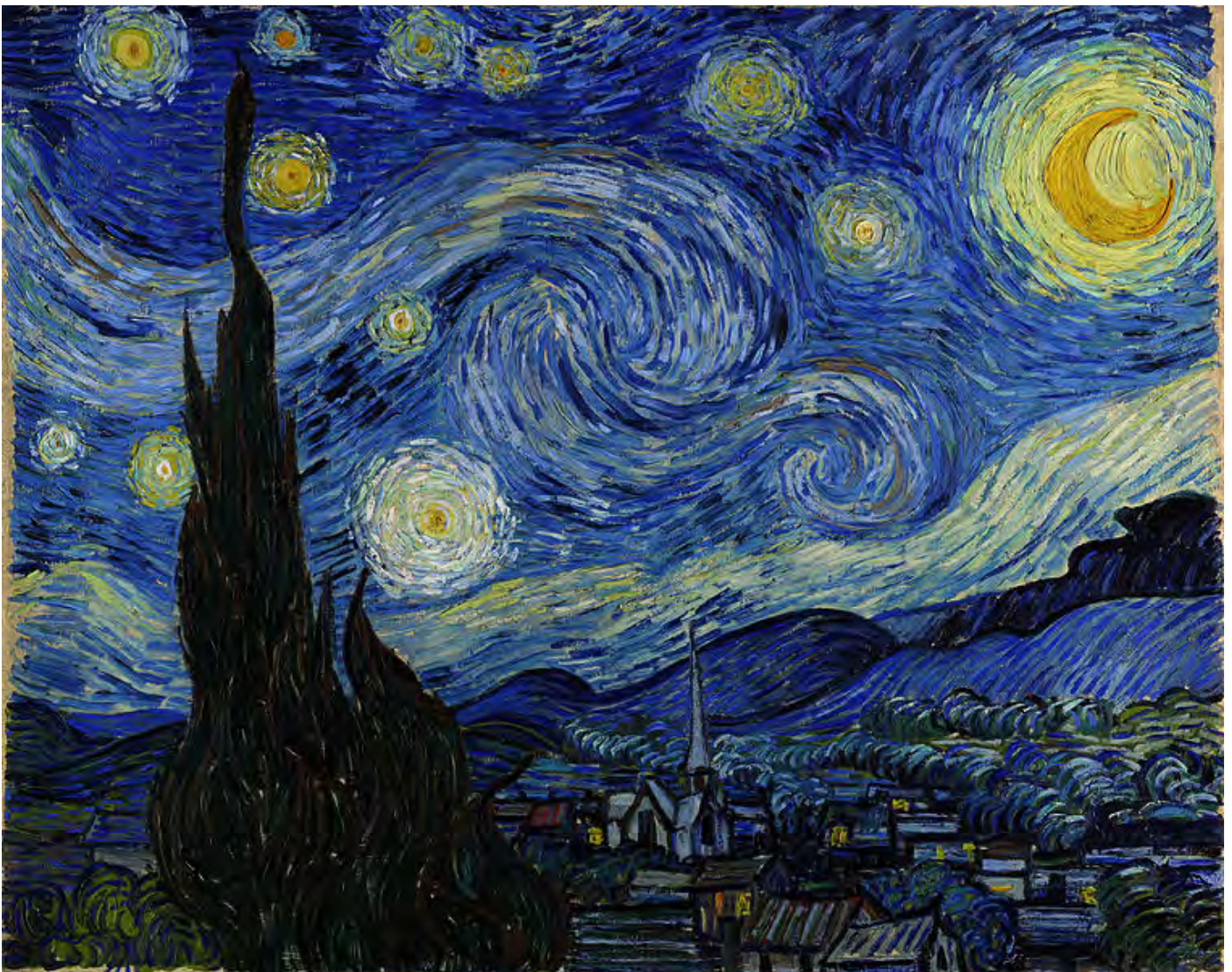
Gogh, Vincent van, 1853-1890. Starry Night , from Art in the Christian Tradition , a project of the Vanderbilt Divinity Library, Nashville

As Sydney's oldest church, St James' is a place of soul-stirring worship, challenging preaching and fine music.