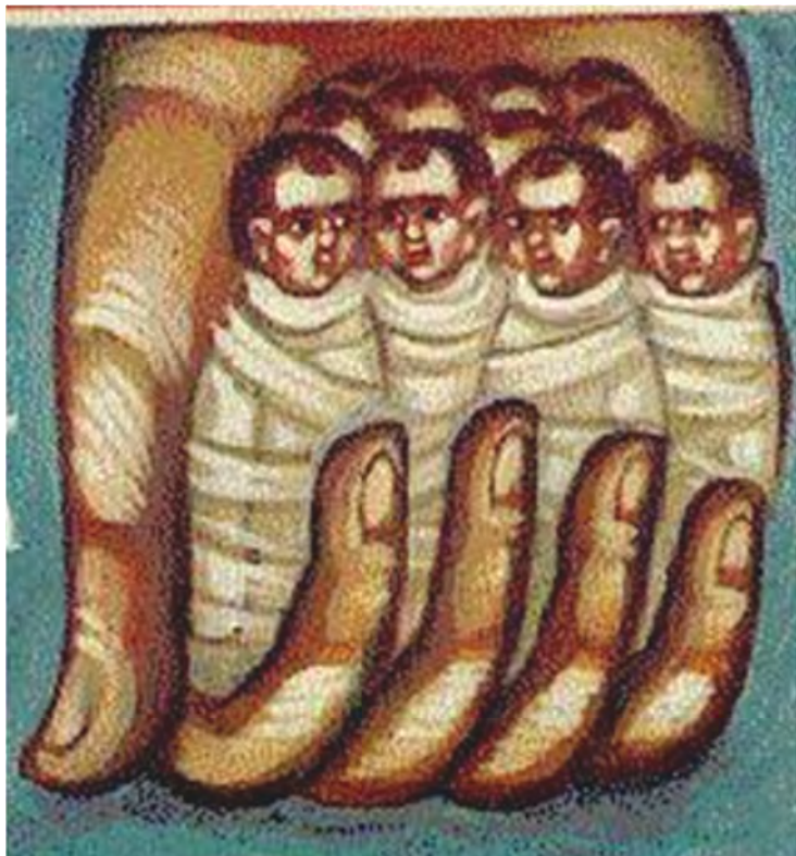
The souls of the righteous, from a Russian icon

The souls of the righteous are in the hand of God, and no torment will ever touch them. In the eyes of the foolish they seemed to have died, and their departure was thought to be an affliction, and their going from us to be their destruction; but they are at peace.