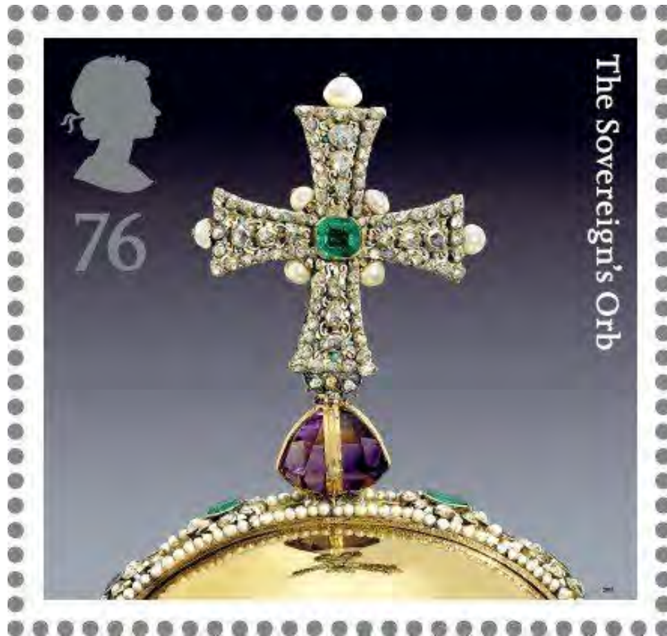
The Sovereign's Orb