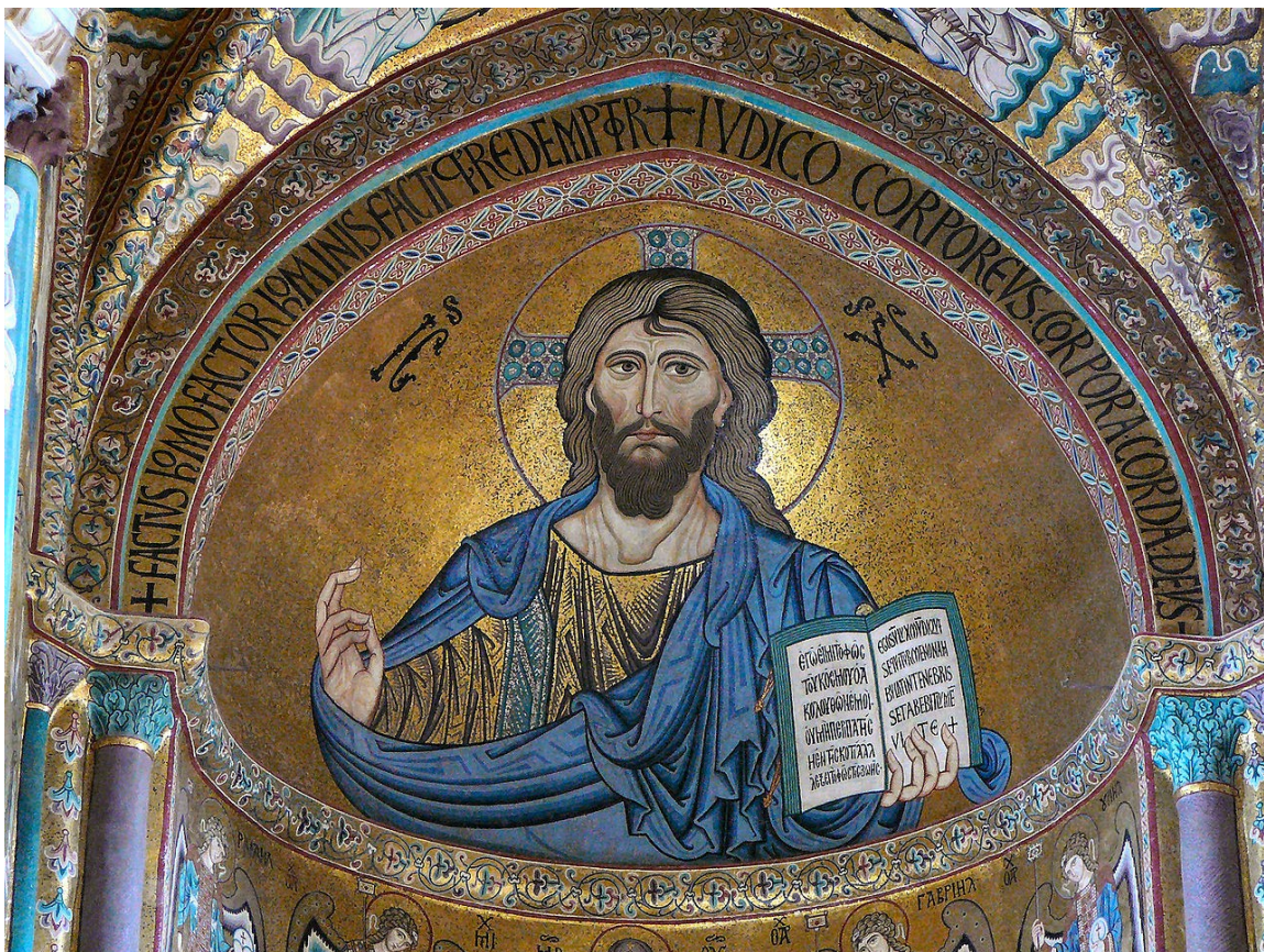
The mosaic of Christ Pantocrator in Cefalù Cathedral, Sicily.

As Sydney's oldest church, St James' is a place of soul-stirring worship, challenging preaching and fine music. We are a progressive community that welcomes all people regardless of age, race, sexual orientation, gender identity, or religion. We also acknowledge the traditional custodians of the land on which we worship—the Gadigal of the Eora Nation.