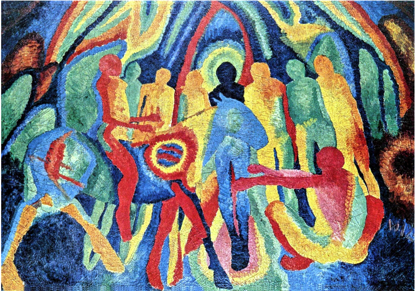
Einzug Christi in Jerusalem (Entry of Jesus in Jerusalem) Morgner, Wilhelm 1912, Oil on Canvas